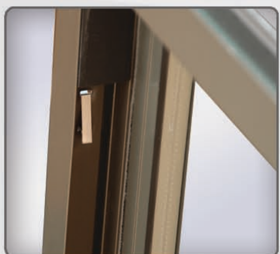
Removable Take-Out Clips