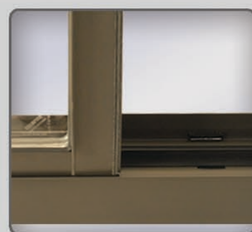
Weep Covers with Doors