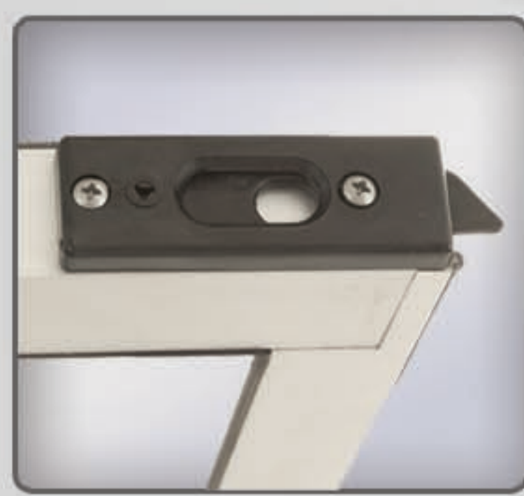
Easy to Operate Tilt Latches