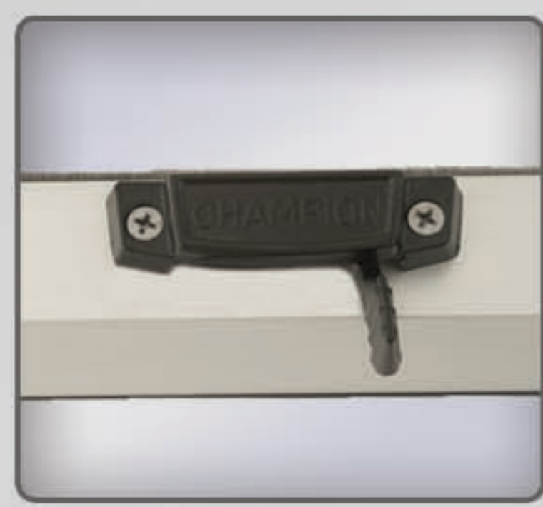
Engraved Metal Lock