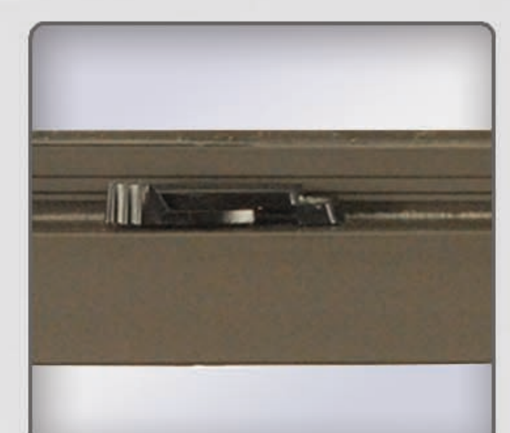
Engraved Metal Lock