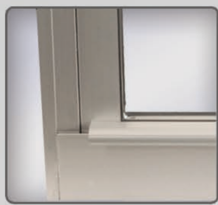
Easy-Grip Lift Rail

The Champion 2500 Tilt Double Hung window is a commercial grade (H-C45/C50) product featuring a 3 1/4" frame with thermally-broken components and comes standard with a top sash anti-drift latch. Options for the 2500 include various fin sizes, air conditioner packages, and integral top or bottom tri-lites in a single master frame. Spiral, block and tackle, and Caldwell Ultra-Lift® balances can be installed on both sashes. Historic external muntins, true divide muntins, and historic panning enable the 2500 to be used on historic landmark projects (Approved by the NYC Landmark Preservation Commission). The 2500 is at home in commercial or mid-rise residential applications. Similar to Champion's 2500 in appearance, features, and options, the 2400 utilizes lighter extrusions for appropriate applications, and provides a H-C35 rating.